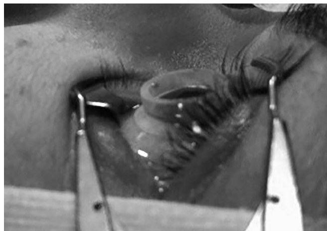
FIGURE 1. Silicone ring during corneal presoak.

Periocular skin was then disinfected with povidone iodine 10% solution. For the corneal presoaking, a Landers vitrectomy silicone ring (12 mm diameter, 3 mm height Ocular Instruments Inc., Bellevue, WA) was placed on the corneoscleral limbus (Fig. 1) to retain the riboflavin solution, composed of riboflavin-dextran 0.1 g/100 g and vitamin E-TPGS 500 mg/100 mL, (IROS, Naples, Italy). Drops of this solution were delivered into the silicone ring to completely cover the cornea. Filled with solution, the ring was maintained in place for 15 minutes. Further drops were added as necessary to maintain corneal coverage with the solution. After the corneal presoak, a slit-lamp examination was then performed to observe the complete yellow dyeing of corneal tissue and the greenish Tyndall effect in the anterior chamber with a blue filter, indicating adequate passage of the riboflavin solution.